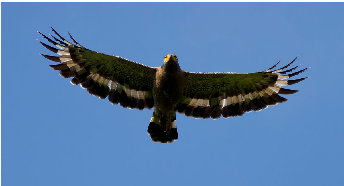
Crested Serpent Eagle, at Malcolm Park, 261011