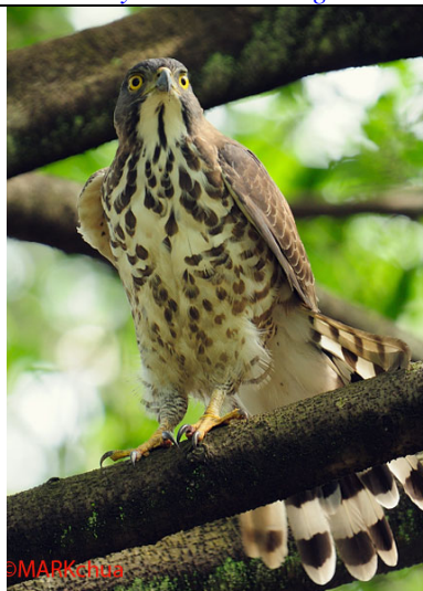
Crested Goshawk, immature, 281011, Old Jurong Lake Park