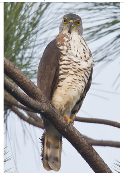
Crested Goshawk, adult, Japanese Garden, 311011, by Nicholas Tan