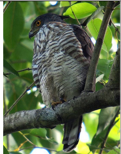
Crested Goshawk, adult, 301011, Sembawang Park