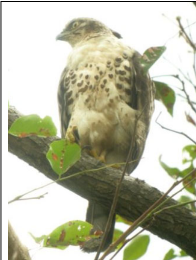
Crested Goshawk, juvenile, 021011, Mt Faber