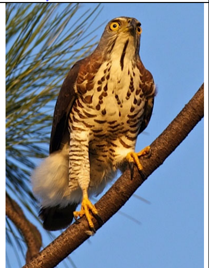
Crested Goshawk, adult, 301011, Japanese Garden, by Jason Cho