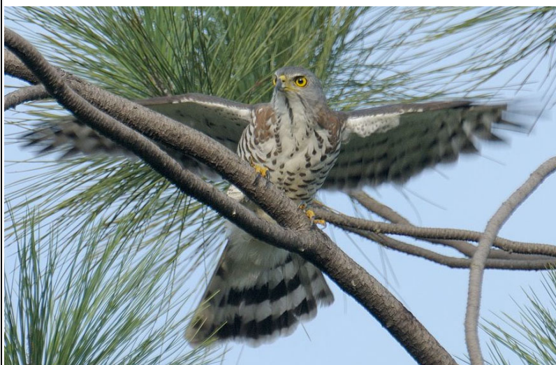
Crested Goshawk, adult, Japanese Garden, 291011, by Chong Yih Yeong