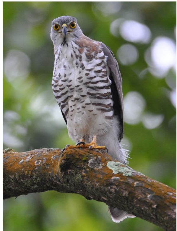
Crested Goshawk, at Japanese Garden, 211011, by Tan Gim Cheong

This was a good month for the Crested Goshawk . A total of 7 were recorded, an unusually high number given its rarity in Singapore. 6 were seen and 1 heard. The presence of at least two adults and an immature at Jurong Lake indicate a possibility of breeding in that area. Sembawang was added as a recent site for this species with 2 recorded by Margie Hall on 26 Oct and 1 adult photographed on 30 Oct. Margie also had the privilege of seeing one bird as it called. In addition, a juvenile was photographed at Mount Faber on 2 Oct and another at Bidadari on 26 Oct. See page 3 for photos of all the 6 Crested Goshawks seen.