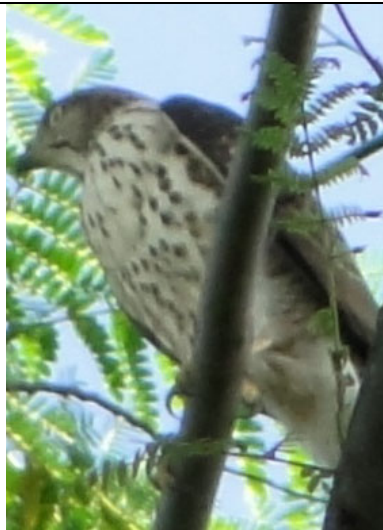
Crested Goshawk, juvenile, 261011, Bidadari