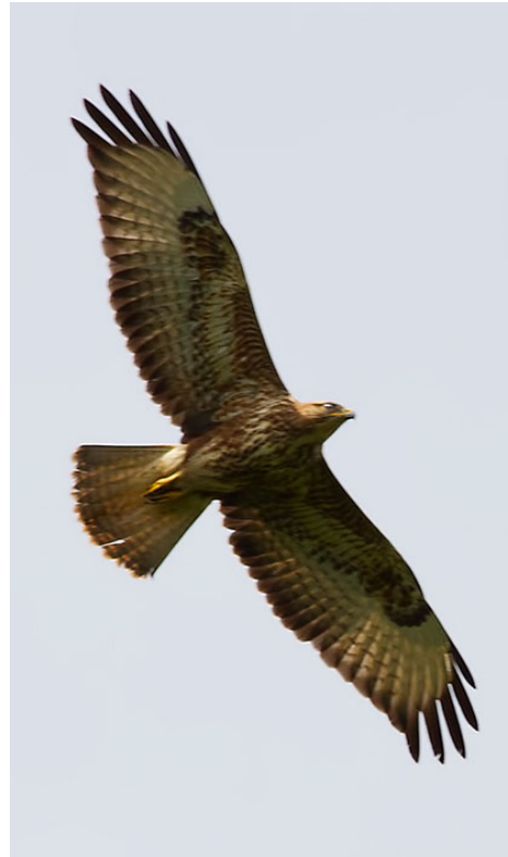
Common Buzzard, juvenile, at Bidadari, 231011

Of the 4 Peregrine Falcons recorded, one put up a good show at Japanese Garden over a few days, feeding on birds. Sun Chong Hong had been looking out for the Peregrine Falcon that he had seen in Spring 2009, Autumn 2009, Spring 2010 and Autumn 2010 in Bishan and he was not disappointed as the falcon turned up on 21 Oct. There were also 4 Chinese Sparrowhawks and 3 Ospreys .